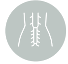
Cauda equina syndrome