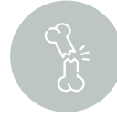
Fractures and dislocations