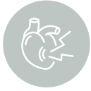
Heart attack (Myocardial Infarction)

Failure to diagnose or delay in diagnosis of